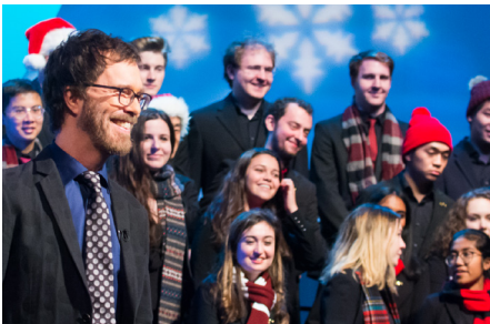
'Tis the Night with Ben Folds & Friends , WGBH's holiday special.