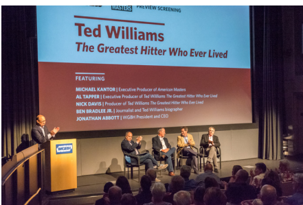
Screening of Ted Williams: "The Greatest Hitter Who Ever Lived" at WGBH's Yawkey Theater.