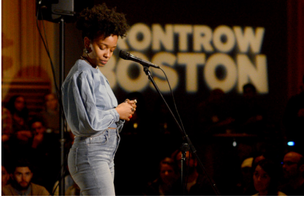
Jamila Woods performs at Fraser Performance Studio for Front Row Boston Live at Fraser.