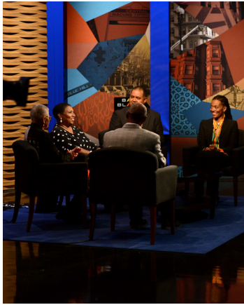
50th anniversary event of Basic Black at WGBH Studios.