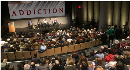
A community advance screening of NOVA's film, Addiction , at WGBH's Yawkey Theater, co-hosted by Massachusetts General Hospital.