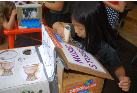
Design Squad Global Pop-up design/build event at the WGBH studio at the Boston Public Library.