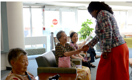
A photo essay of Ayanna Pressley's first days in Washington.