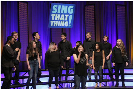
Season Four of Sing that Thing! contestants AmherstDQ.