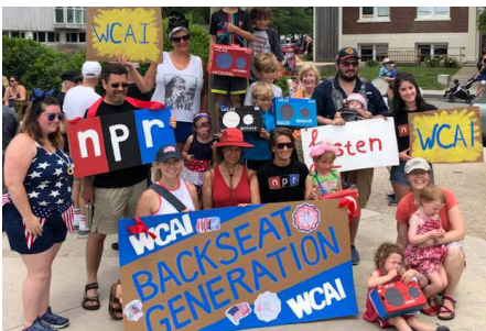
WCAI at the Woods Hole 4th of July parade.