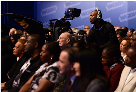
Studio audience at Basic Black 50th anniversary special.