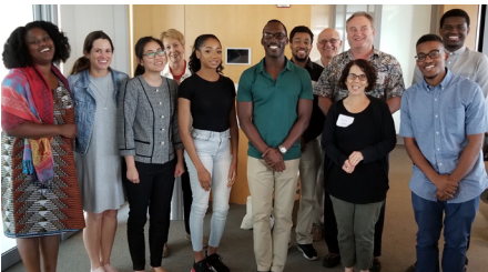
WGBH hosts Boston Public School STEM educators for a professional development event and a studio tour.